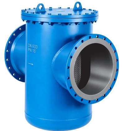
FIG : 352