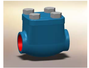
FIG : 442